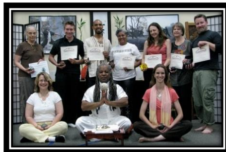
Tai Chi 10 Class Graduates

In addition to Taoist studies, he dedicated another 6 years studying Traditional Oriental Medicine. He is certified in Tui Na Acupressure, Chinese Health and Exercise, and earned a diploma in Massage Therapy through the Pacific College of Oriental Medicine in San Diego, California, 1990.