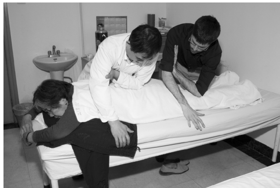
Tui Na Massage Training, Beijing China 2008