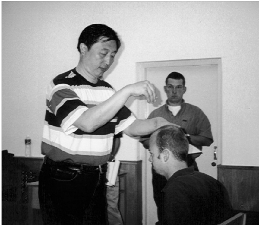
Medical QiGong Technique, Beijing China 1999

Provider Number 450089-06 NCBTMB APPROVED PROVIDER