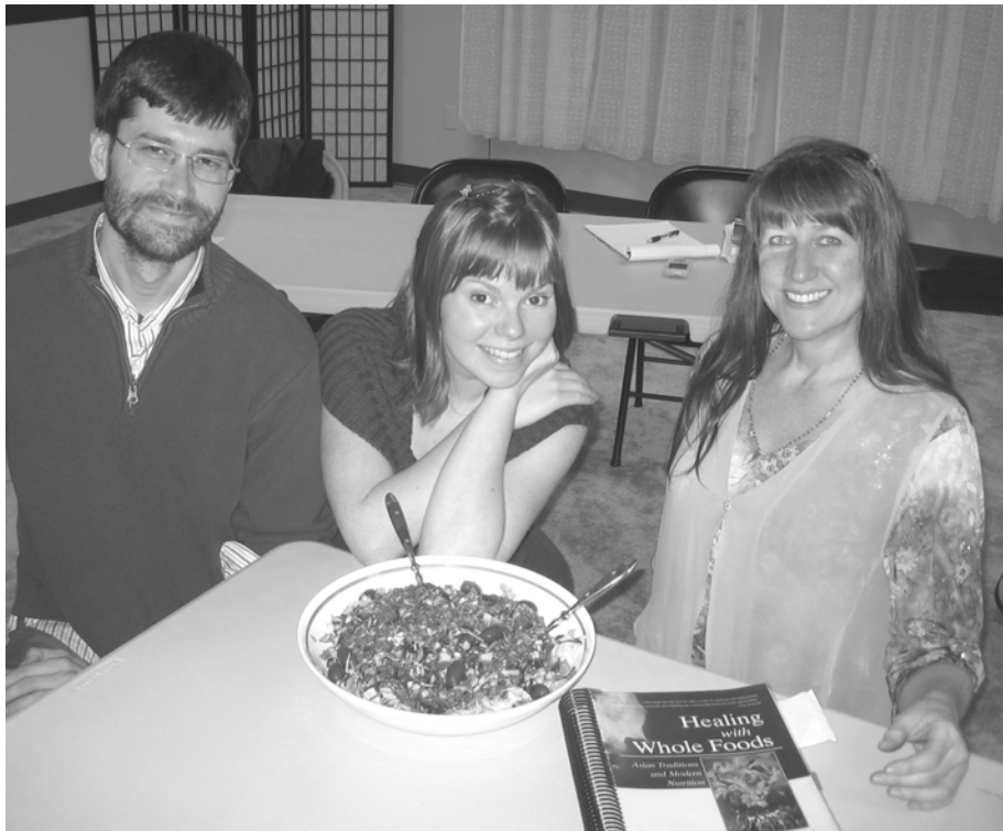
Nutrition Class Benefit: Trying Great Recipes Almost Every Week!

(Nutritional Therapist Level Certification is earned)