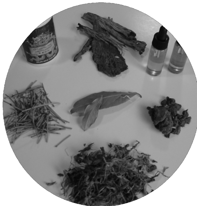
Chinese Herbs and Essential Oils